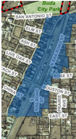
Central Downtown District Highlighted in Blue

Provides grant funding for commercial businesses located in Buda's Downtown District. Three different grants are available; signage, awning, and facade improvement.